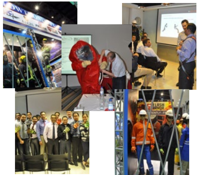
Flowtronix (FT) participates in different trade shows and conducts free trainings and seminars to build product awareness and information.