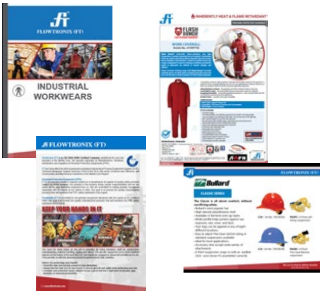
E-marketing collaterals such as Newsletters, Article Data Sheets (ADS), Presentations, Electronic Brochures, Catalogs, and Email Campaigns.