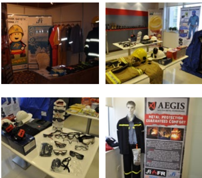
Point-of-Purchase Displays and Freebies as extra sales tools given to retailers to boost sales and promote products.