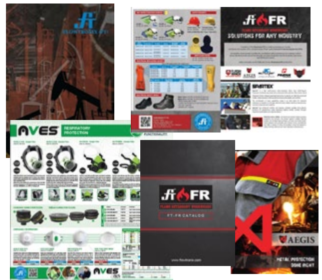
Marketing Collaterals such as Print Media Advertising, Catalogs, Brochures, and Leaflets to support sales of the products.